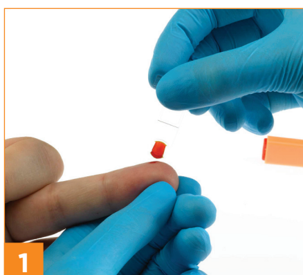
1 Collect blood sample.