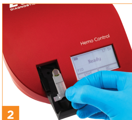
2 Put microcuvette into analyzer.