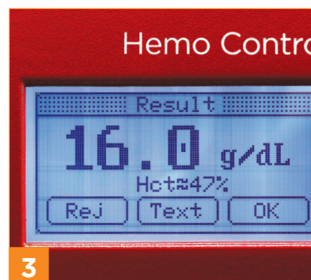
3 Result appears in 25–60 seconds.